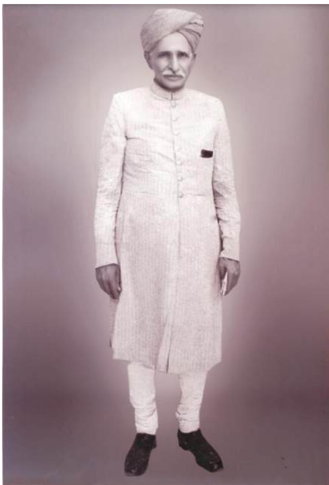
Deenbandhu Chhotu Ram (November 24, 1881 – January 09, 1945)